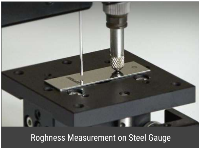
Roughness Measurement on Steel Gauge