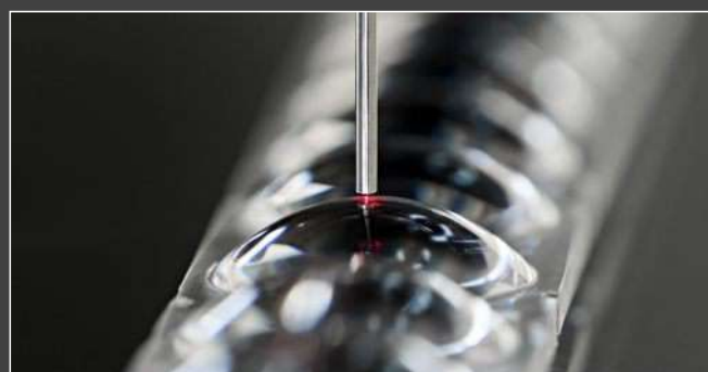
Surface Scanning of a Lens Array

We develop tailor-made solutions for a wide range of applications and requirements. Feel free to contact us.